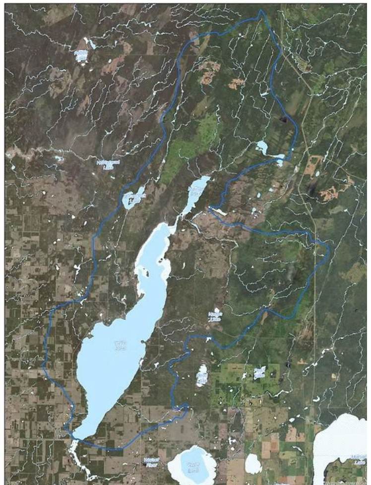
Turtle Lake Basin